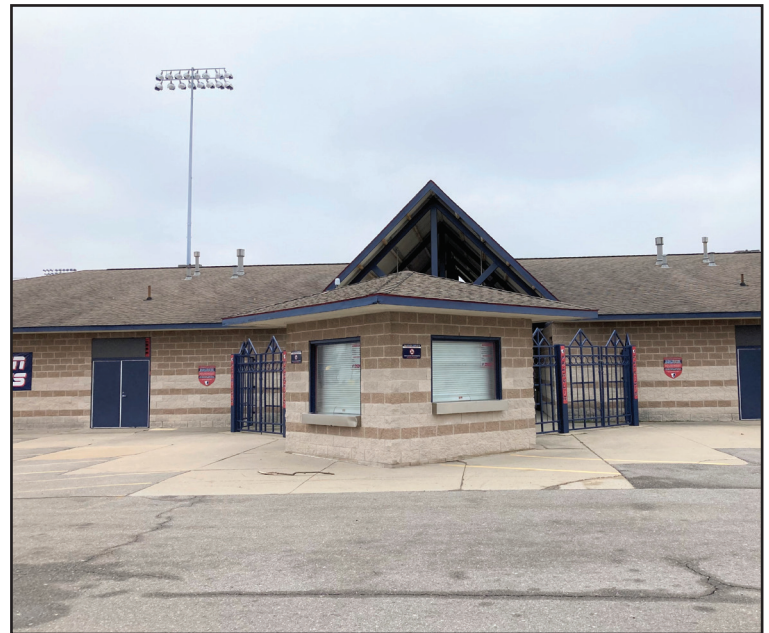
High school athletic facilities