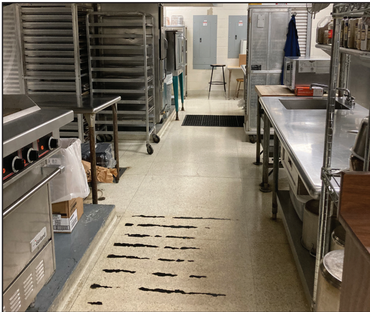
Kitchens and serving lines